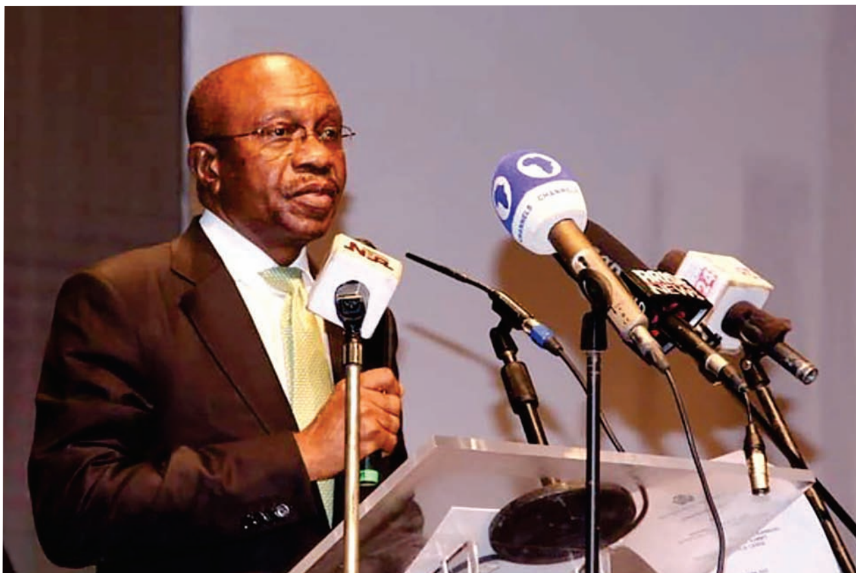
Mr. Godwin Emefiele Governor, CBN