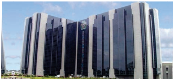
Central Bank of Nigeria Building, Abuja

The Central Bank of Nigeria, (CBN) has announced the sell of N1.2 trillion worth of Treasury Bills in the third quarter of 2022. This was revealed by the Bank, in its Nigeria Treasury Bills Issue Programme for Quarter 3 of 2022.