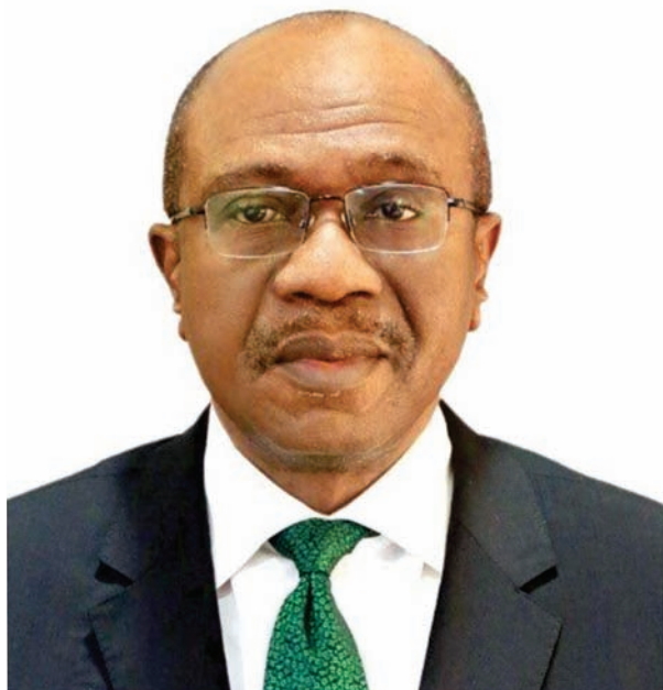
Mr. Godwin Emefiele Governor, CBN

T he Governor, Central Bank of Nigeria (CBN), Mr. Godwin Emefiele, has charged the West African Institute for Financial and Economic Management (WAIFEM) to enhance the capacity of technical staff and policy makers in the sub-region, in order to promote sound macroeconomic management.