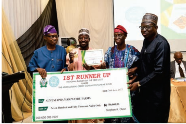
Winners of the Agricultural Credit Guarantee Scheme Fund (ACGSF) 2021 Best Farmers Award

The Central Bank of Nigeria (CBN) has restated its commitment in supporting hard work, innovation, and productivity in the agricultural value chain of the country, in a bid to boost economic growth and development.