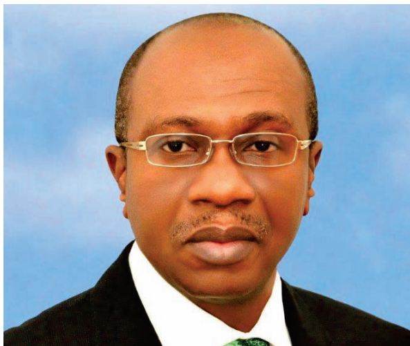
Mr. Godwin Emefiele Governor, CBN

The Central Bank of Nigeria (CBN) has disbursed N21bn to boost the production and export of cocoa and sesame seeds.